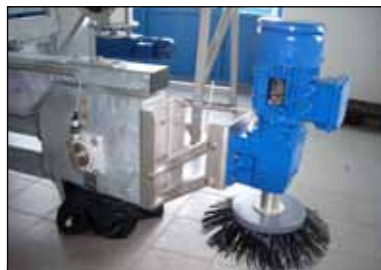
KD 16.19 Runway brush.