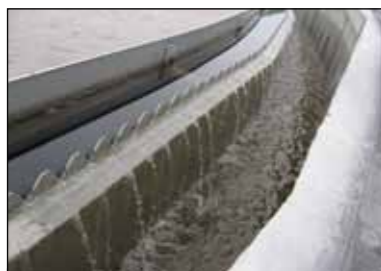
Concrete channel with: KD 16.17 Scum board KD 16.14 V-notch weir