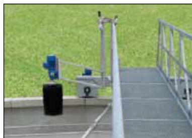
KD 16.11 Channel brush.