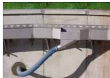
KD 16.08 Scum outlet, fitted directly to KD 16.18 stainless steel channel, where the side facing the centre part acts as scum board. Can also be fitted to KD 16.17 scum board.