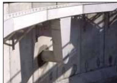
KD 16.18 stainless steel channel with outlet.