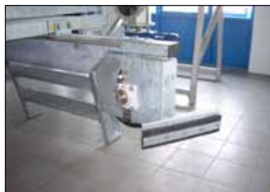
KD 16.10 Snow scraper.