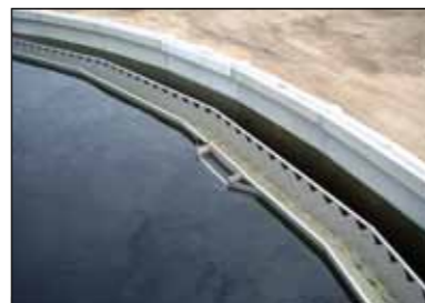
KD 16.08 Scum outlet, fitted directly to KD 16.18 stainless steel channel, where the side facing the centre part acts as scum board. Can also be fitted to KD 16.17 scum board.