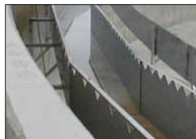
KD 16.18 stainless steel channel with V-notch weir on both sides, as well as KD 16.17 scum board.